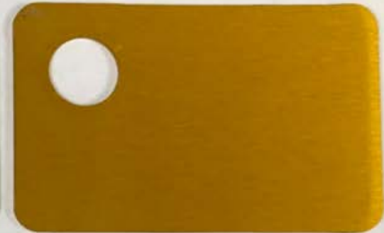
Sulfuric Acid Anodize (SAA) with NICKEL ACETATE SEAL "GOLD" DYE APPLICATION