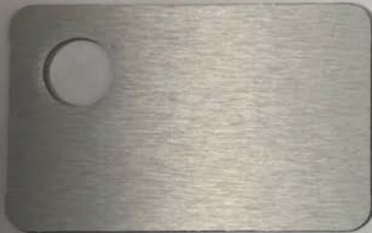
Sulfuric Acid Anodize (SAA) with HOT WATER SEAL "CLEAR"