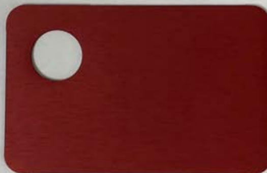
Sulfuric Acid Anodize (SAA) with NICKEL ACETATE SEAL "RED" DYE APPLICATION