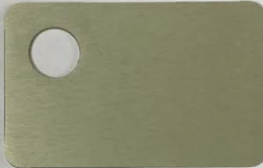
Sulfuric Acid Anodize (SAA) with DICHROMATE SEAL NO DYE APPLICATION