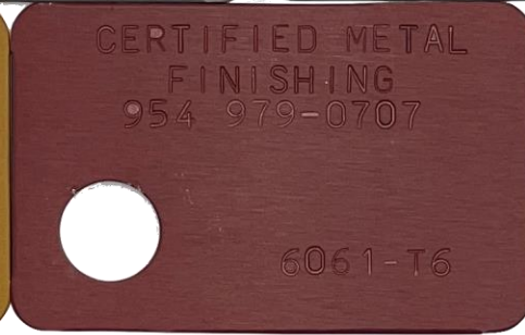
HARDCOAT ANODIZE (TYPE III) "RED" DYE APPLICATION