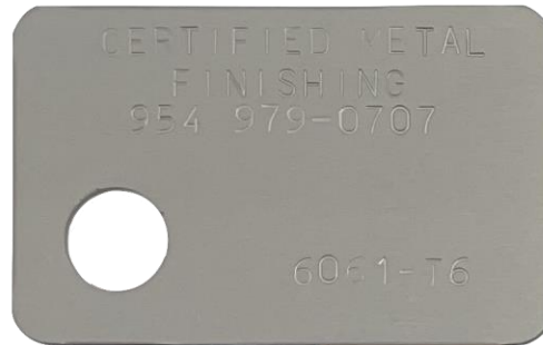
HARDCOAT ANODIZE (TYPE III) THICKNESS 0.0005"