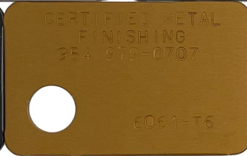
HARDCOAT ANODIZE (TYPE III) "GOLD" DYE APPLICATION