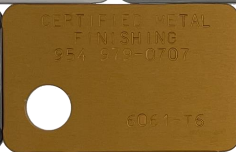
HARDCOAT ANODIZE (TYPE III) "GOLD" DYE APPLICATION