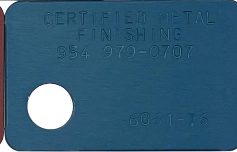
HARDCOAT ANODIZE (TYPE III) "BLUE" DYE APPLICATION