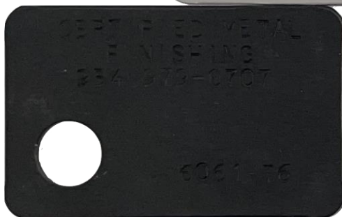
HARDCOAT ANODIZE (TYPE III) "BLACK" DYE APPLICATION