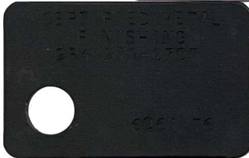
HARDCOAT ANODIZE (TYPE III) "BLACK" DYE APPLICATION