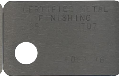
HARDCOAT ANODIZE (TYPE III) THICKNESS 0.002"