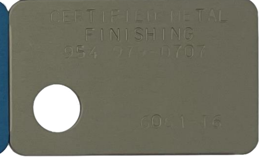
HARDCOAT ANODIZE (TYPE III) WITH DICHROMATE SEAL NO DYE APPLICATION