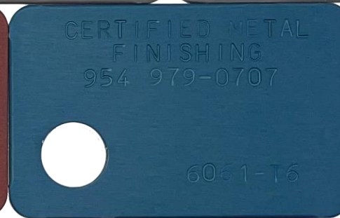
HARDCOAT ANODIZE (TYPE III) "BLUE" DYE APPLICATION