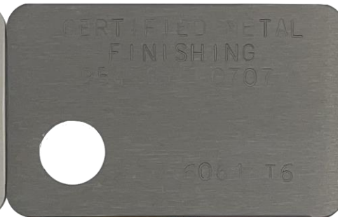
HARDCOAT ANODIZE (TYPE III) THICKNESS 0.001"