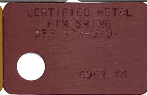
HARDCOAT ANODIZE (TYPE III) "RED" DYE APPLICATION