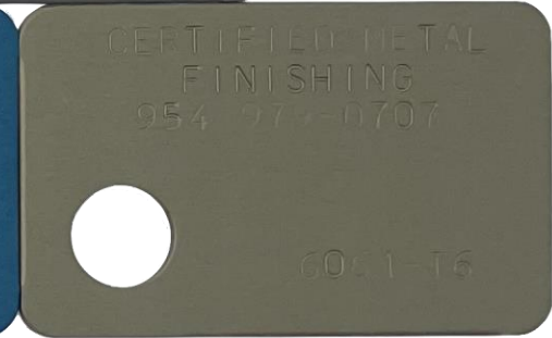
HARDCOAT ANODIZE (TYPE III) WITH DICHROMATE SEAL NO DYE APPLICATION