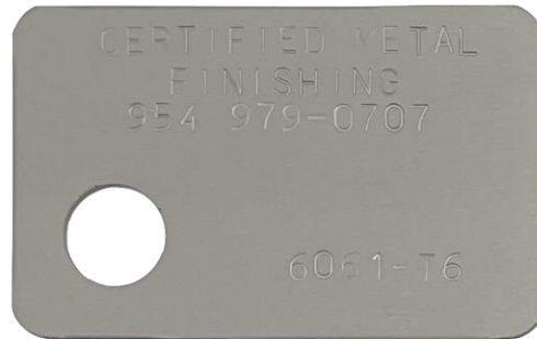
HARDCOAT ANODIZE (TYPE III) THICKNESS 0.0005"